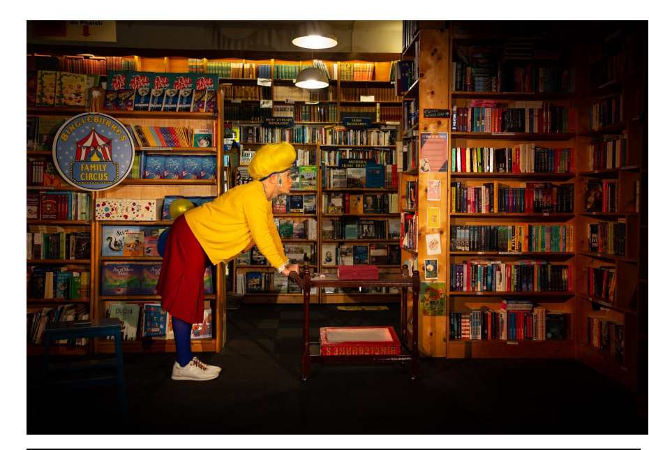
In most pictures the Libravian wears a yellow sweater, but in the show it will be a blue jacket.

So she decides to read the beginning of other people's stories, because she loves books and is much more confident with other peoples' stories.