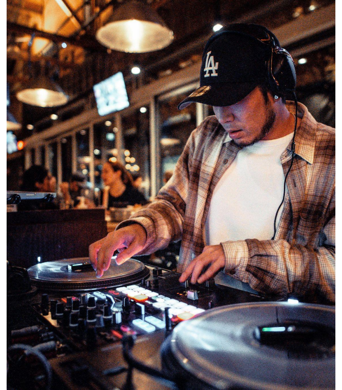
The DJ mixer