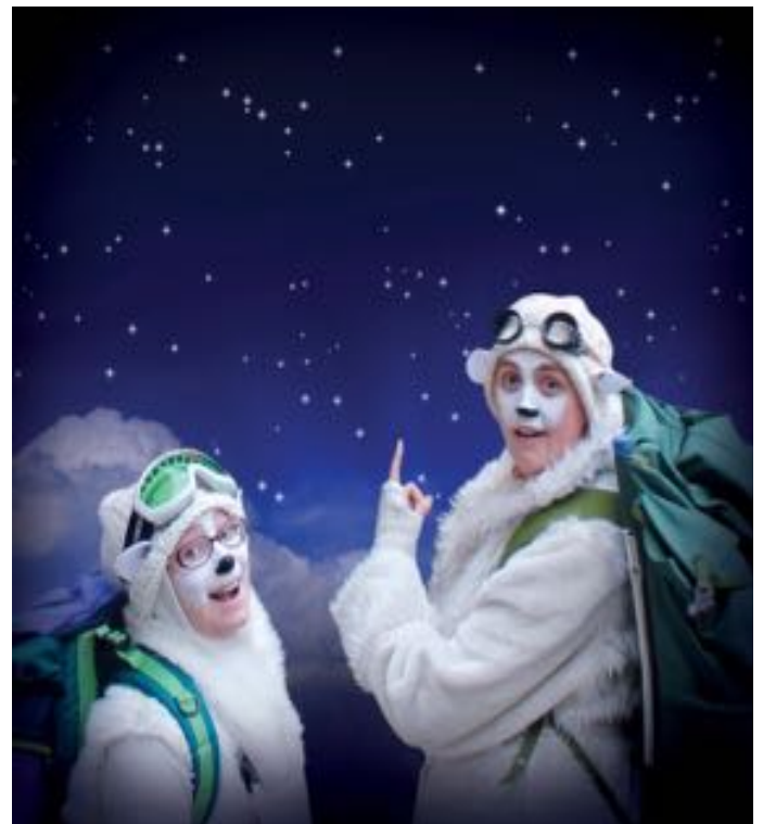
Small Polar Bear