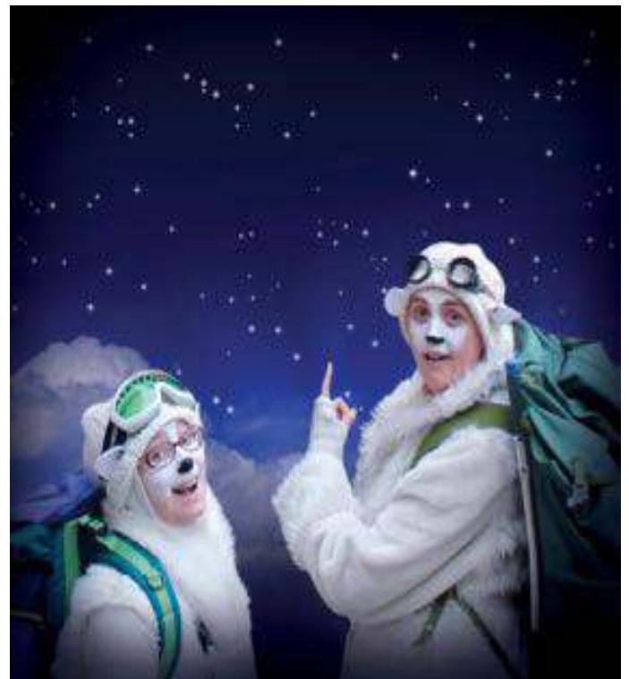
Small Polar Bear